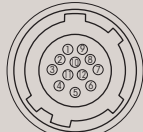
Multi 12-pin Connector