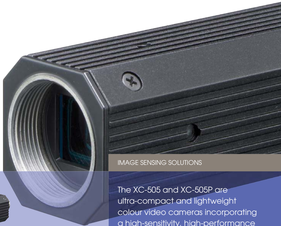
IMAGE SENSING SOLUTIONS

The XC-505 and XC-505P are ultra-compact and lightweight colour video cameras incorporating a high-sensitivity, high-performance 1/3-type Super HAD II CCD.